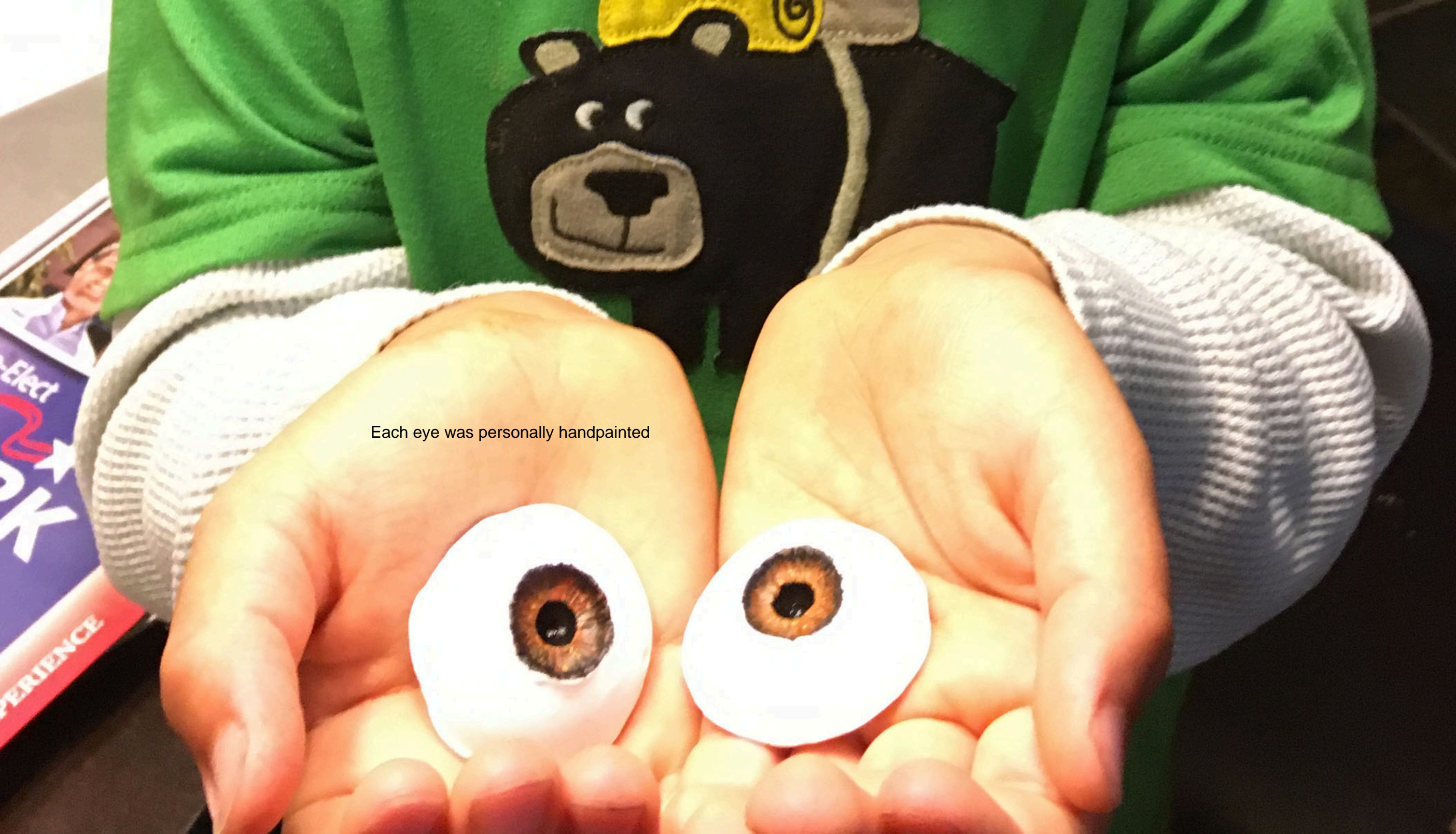
Each eye was personally handpainted